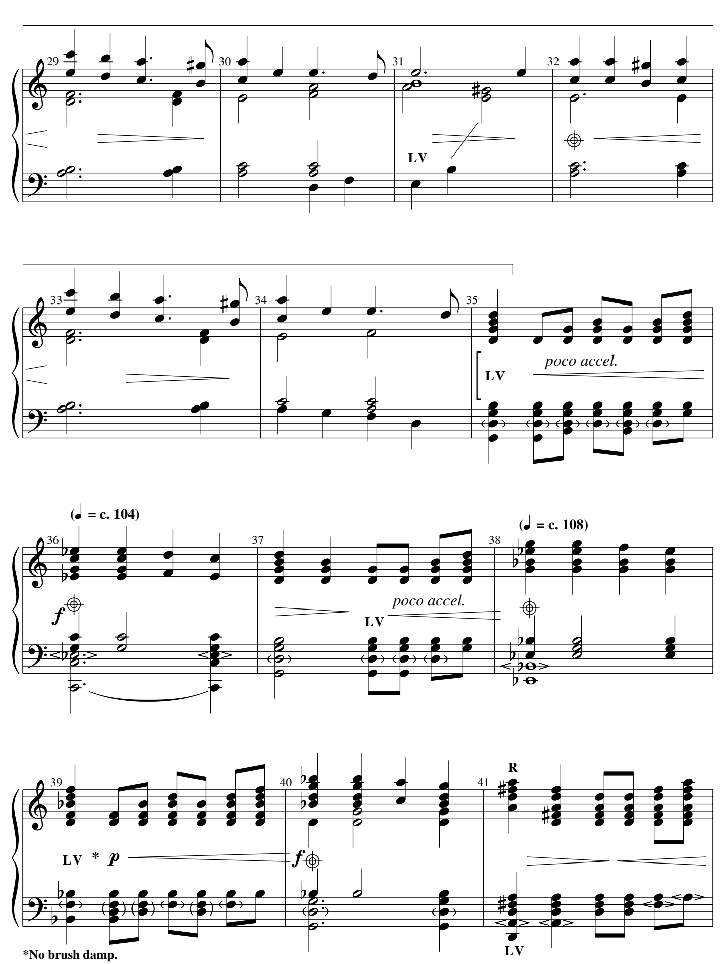
O Little Town of Bethlehem