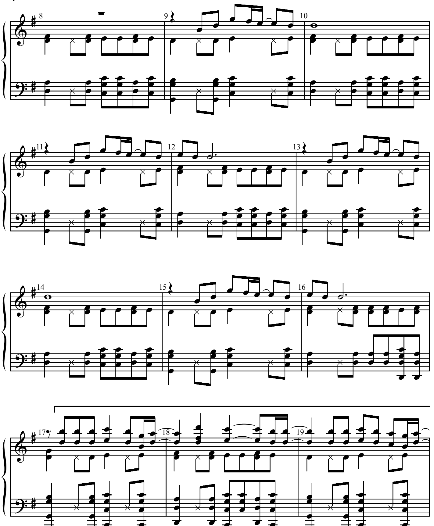
*Five and six octave choirs double all stems-up treble clef notes under the brackets in measures 17-25 and 48-55. Five octave choirs do NOT double the F#6 an octave higher under the brackets in measures 18, 20, 49 and 51.