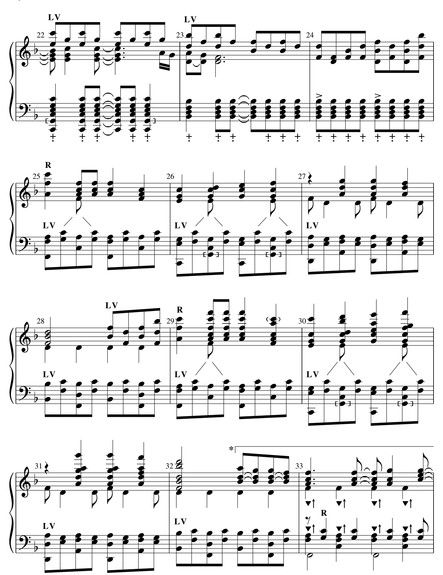
*5 octave choirs double melody an octave higher.