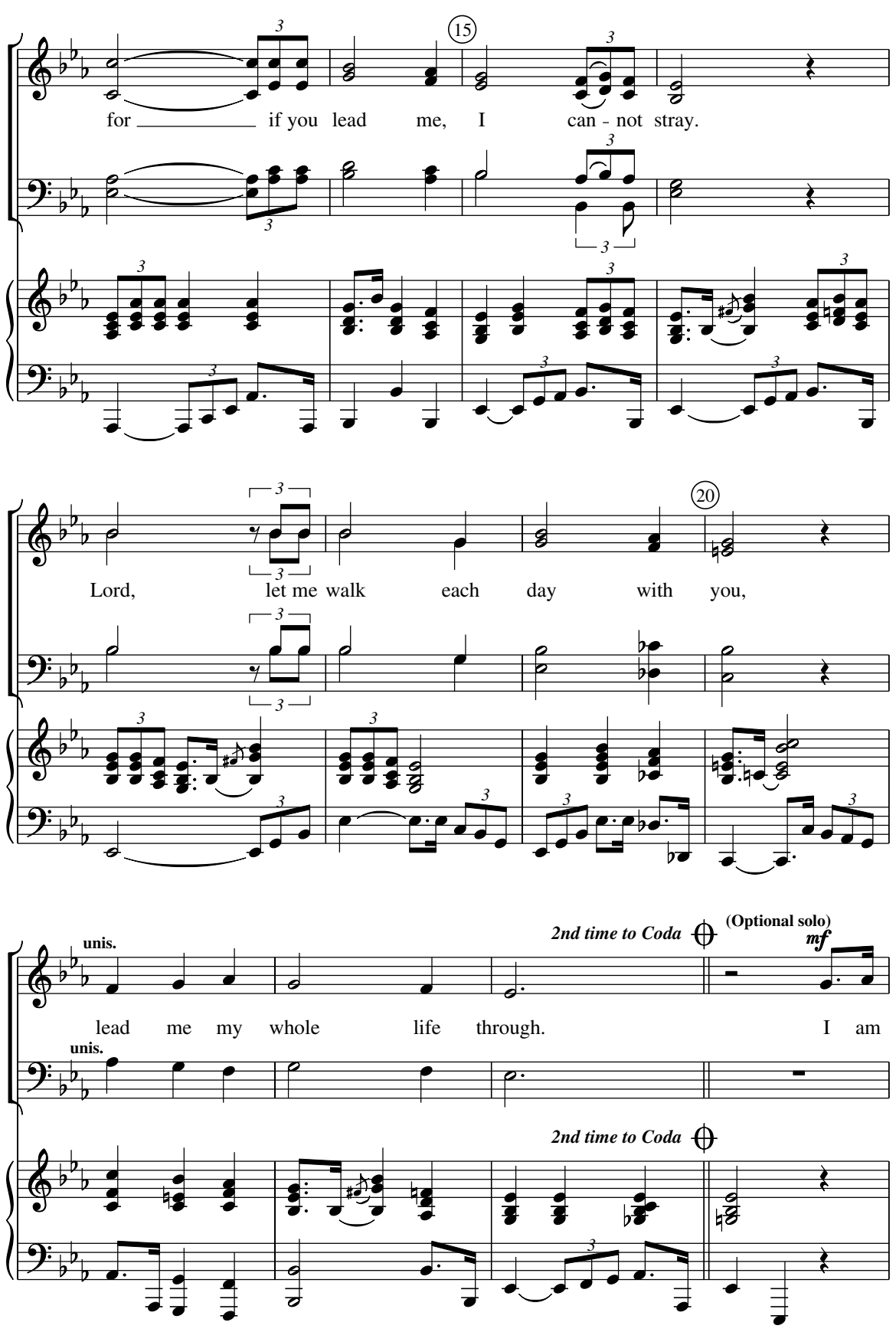
Lead Me, Guide Me