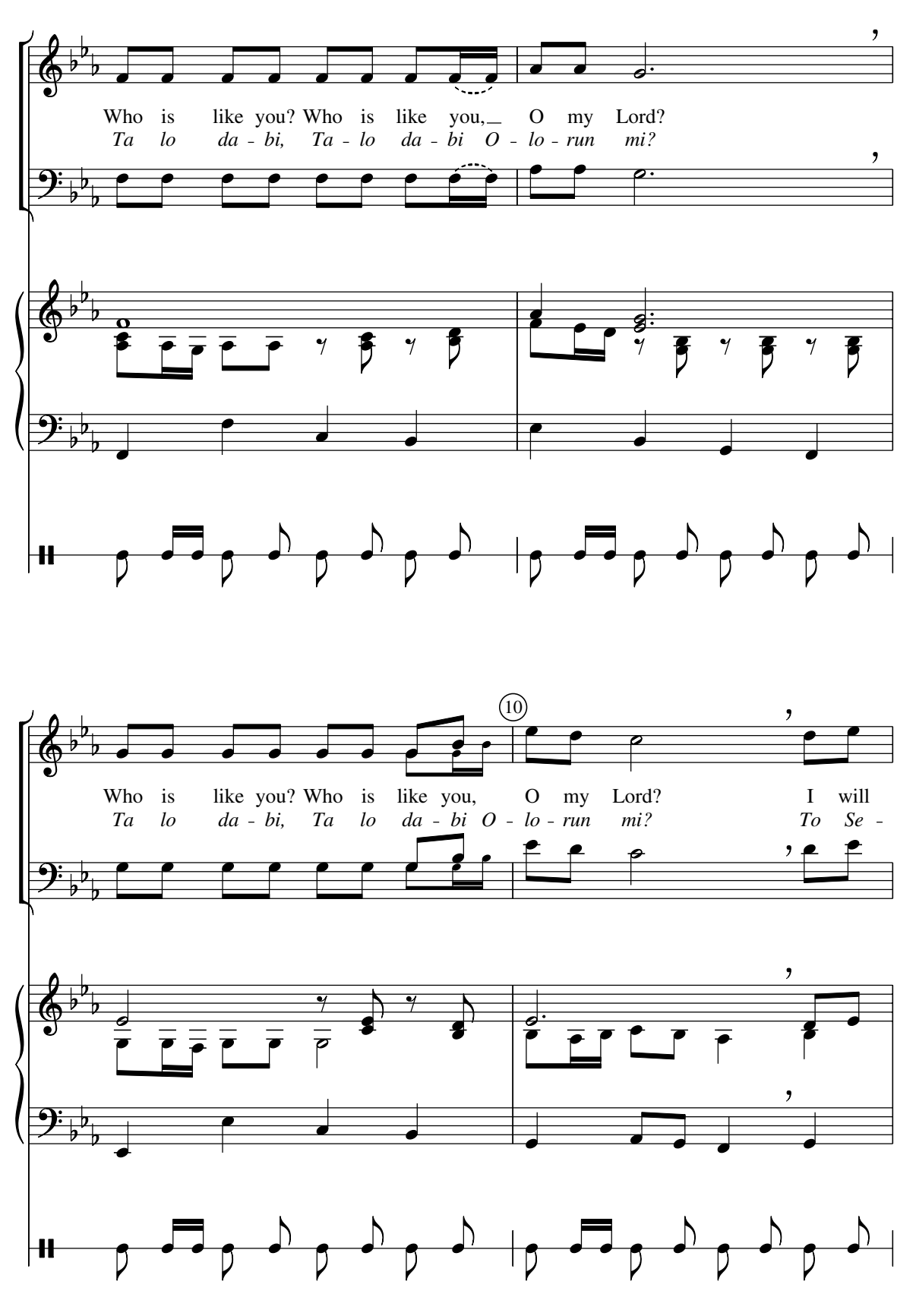
Who Is Like You, O Lord?