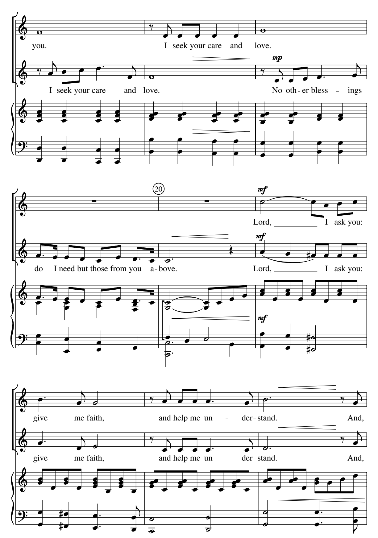
Lord, I Stretch My Hands to You