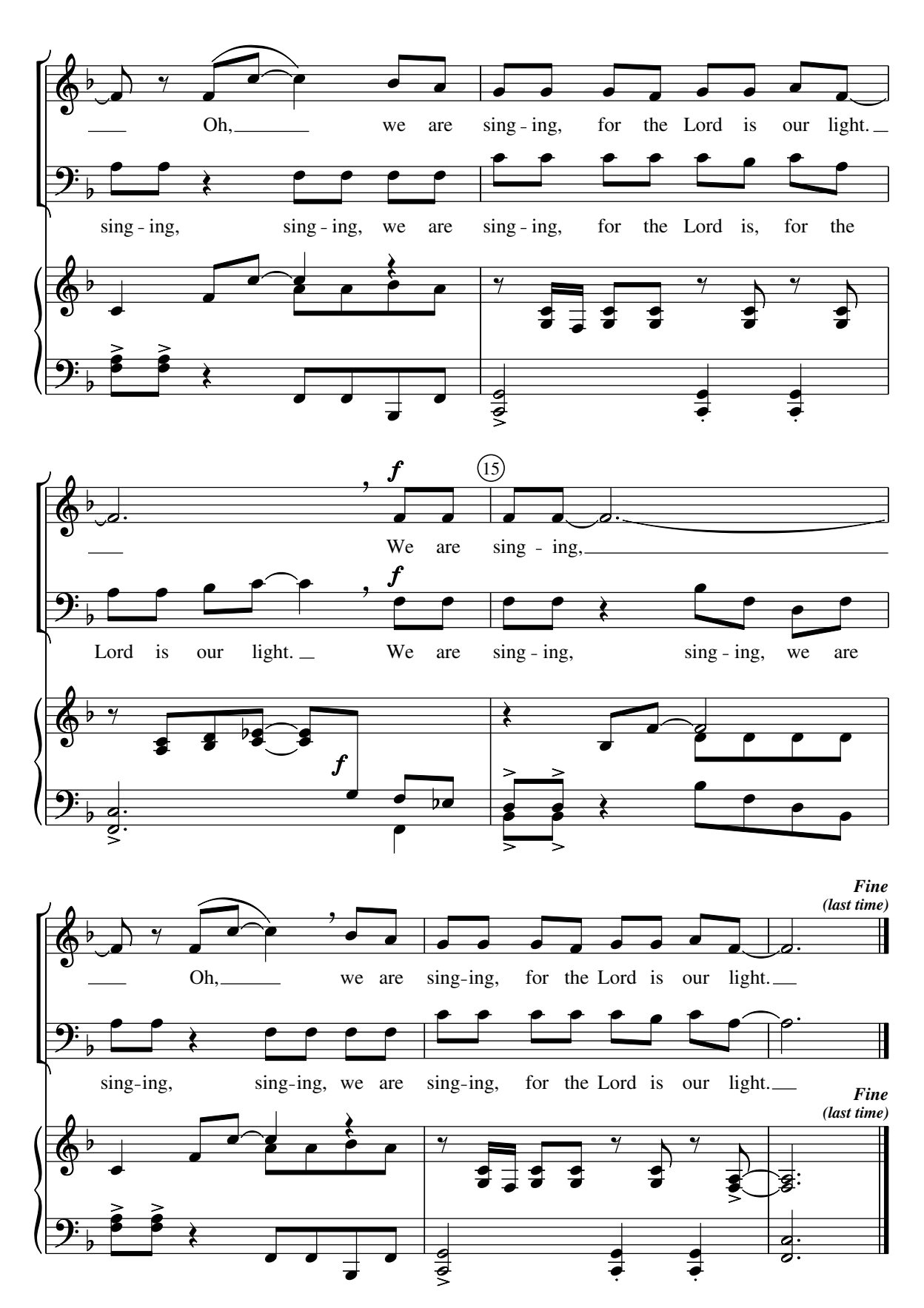
We Are Singing for the Lord Is Our Light