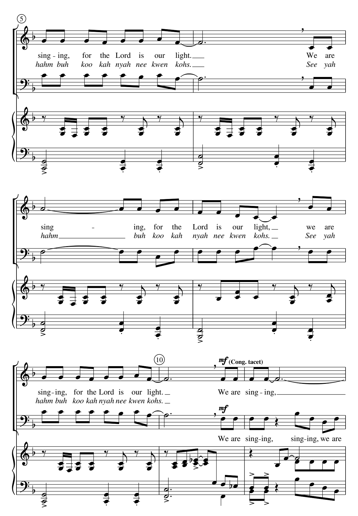
We Are Singing for the Lord Is Our Light