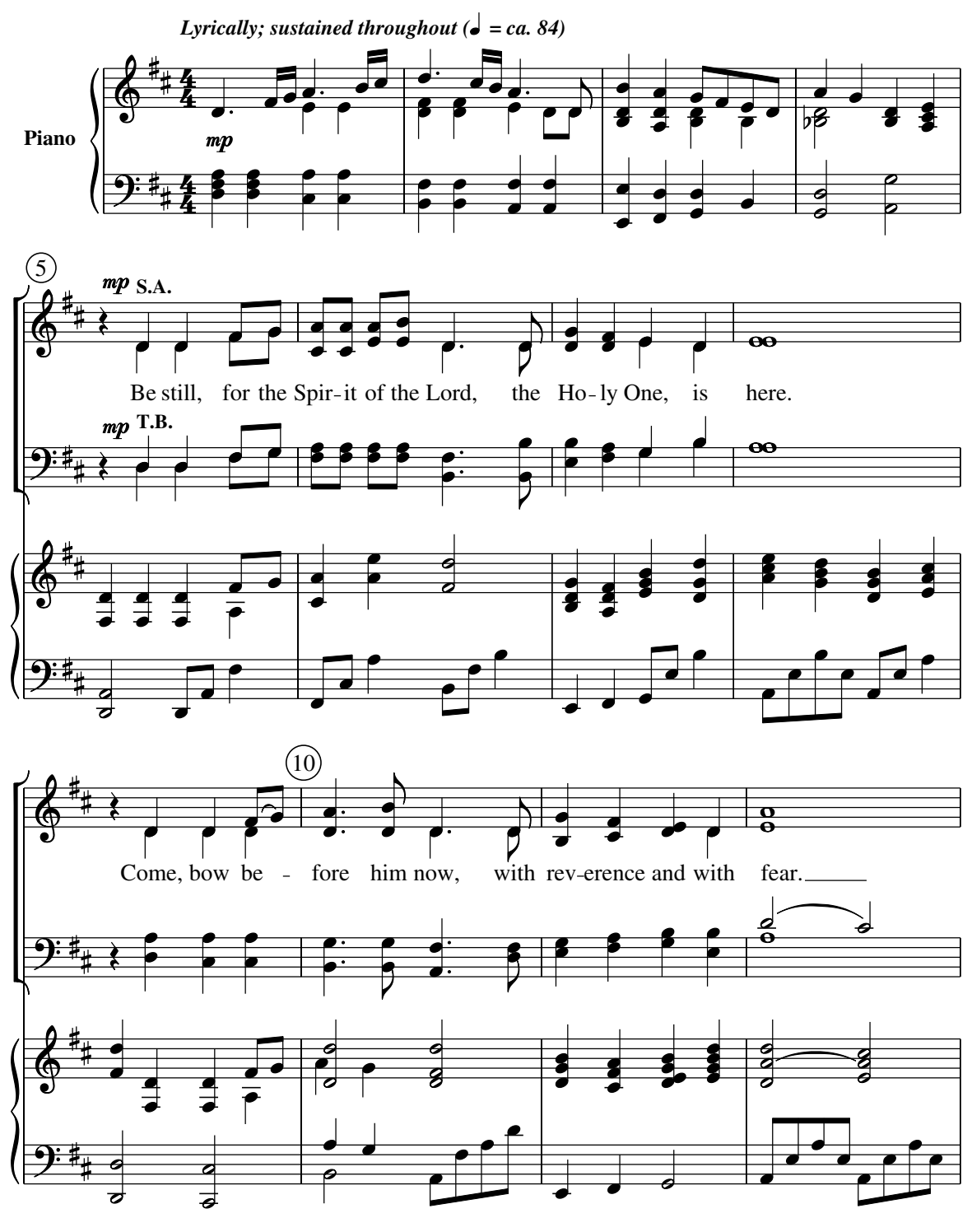
© 1986 and this Arr. © 2005 ThankYou Music (Admin. by EMI Christian Music Publishing) All rights reserved. Used by permission.

Sole selling agent for this 2005 arrangement: Hope Publishing Company, Carol Stream, IL 60188.