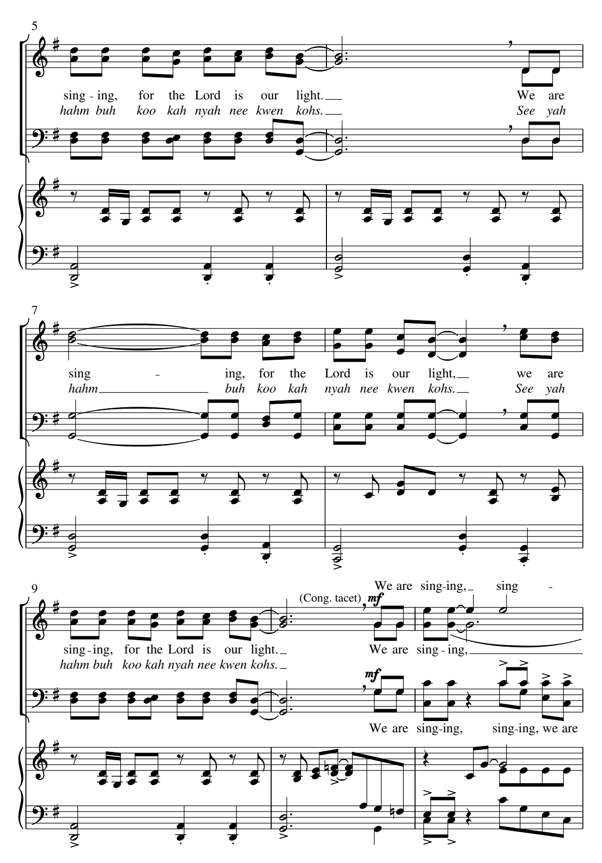
We Are Singing, for the Lord Is Our Light