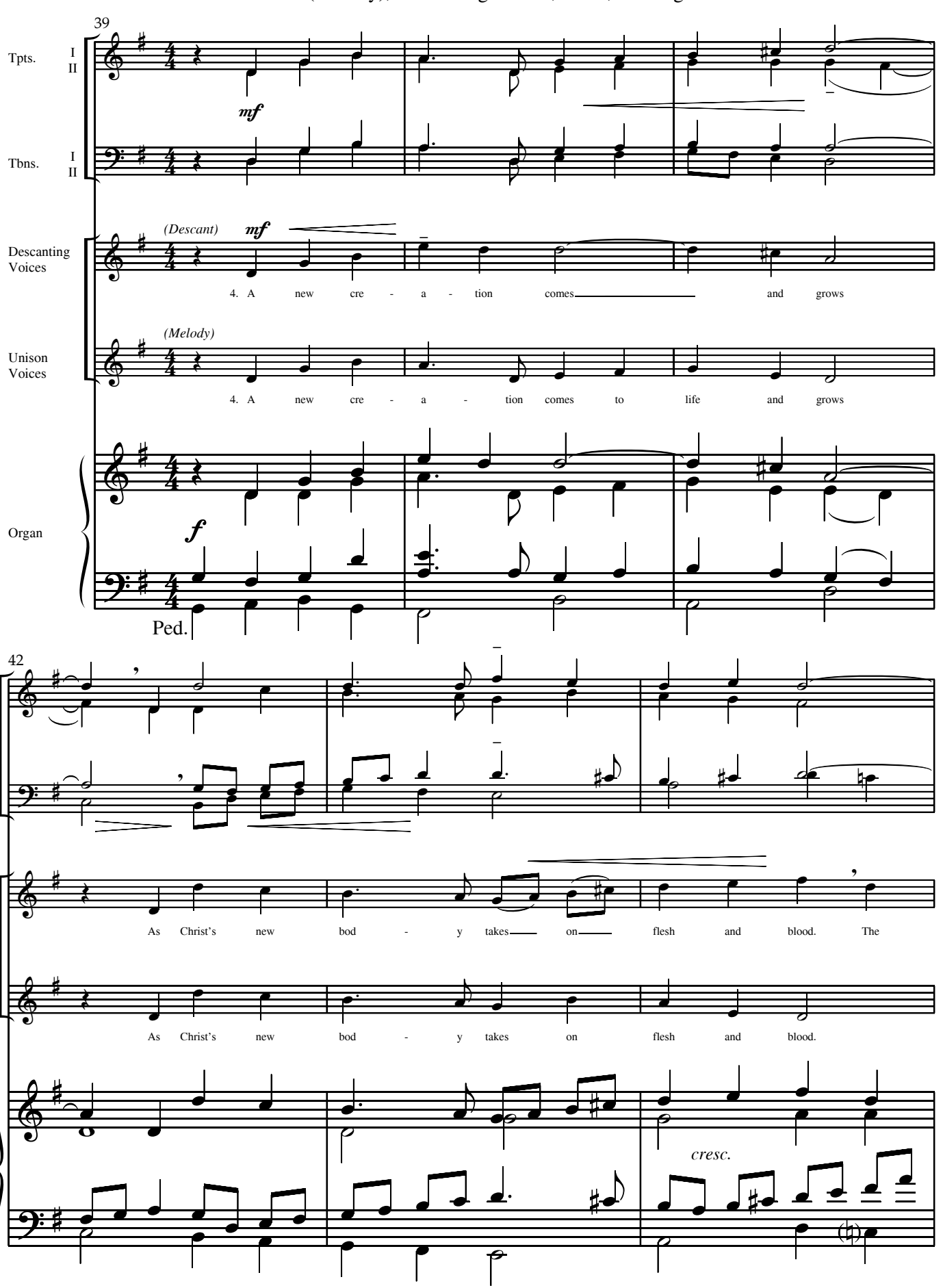
Stanza 4: Unison Voices (Melody), Descanting Voices, Brass, and Organ