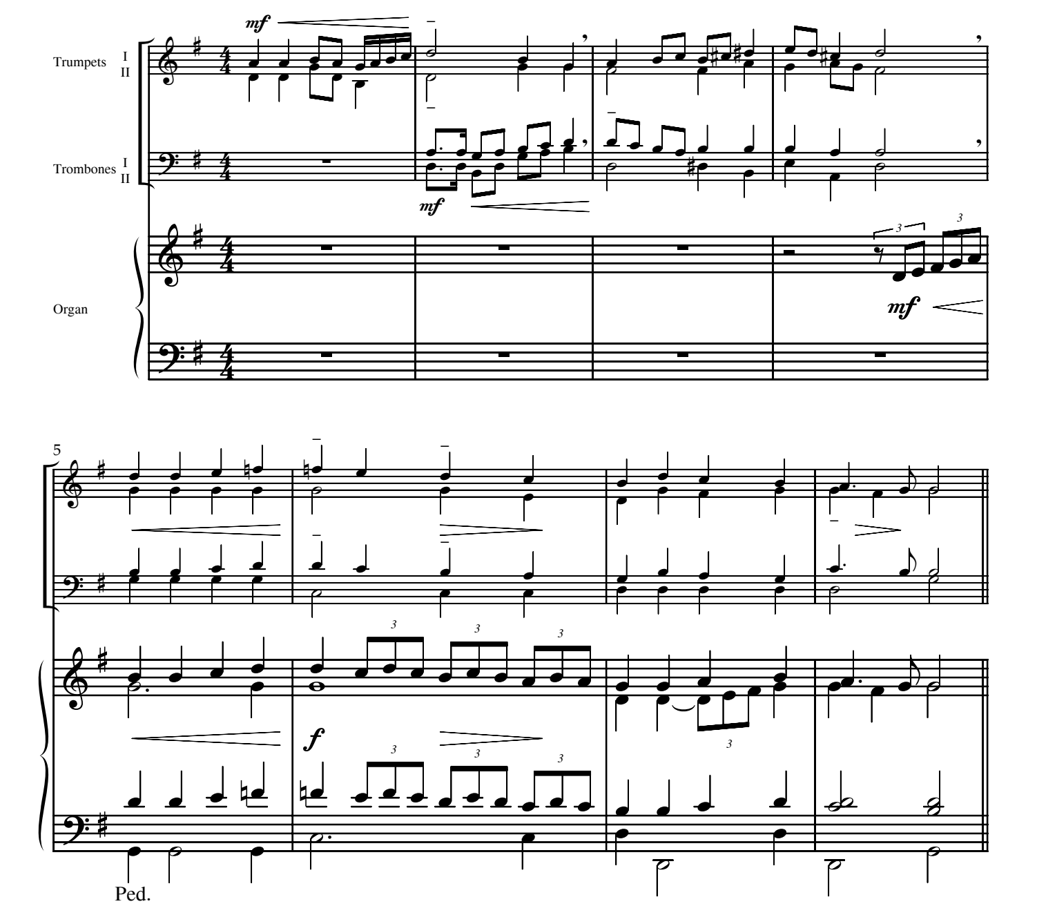
Copyright © 2000 MorningStar Music Publishers of St. Louis 1727 Larkin Williams Road, Fenton, MO 63026. Printed in U.S.A.