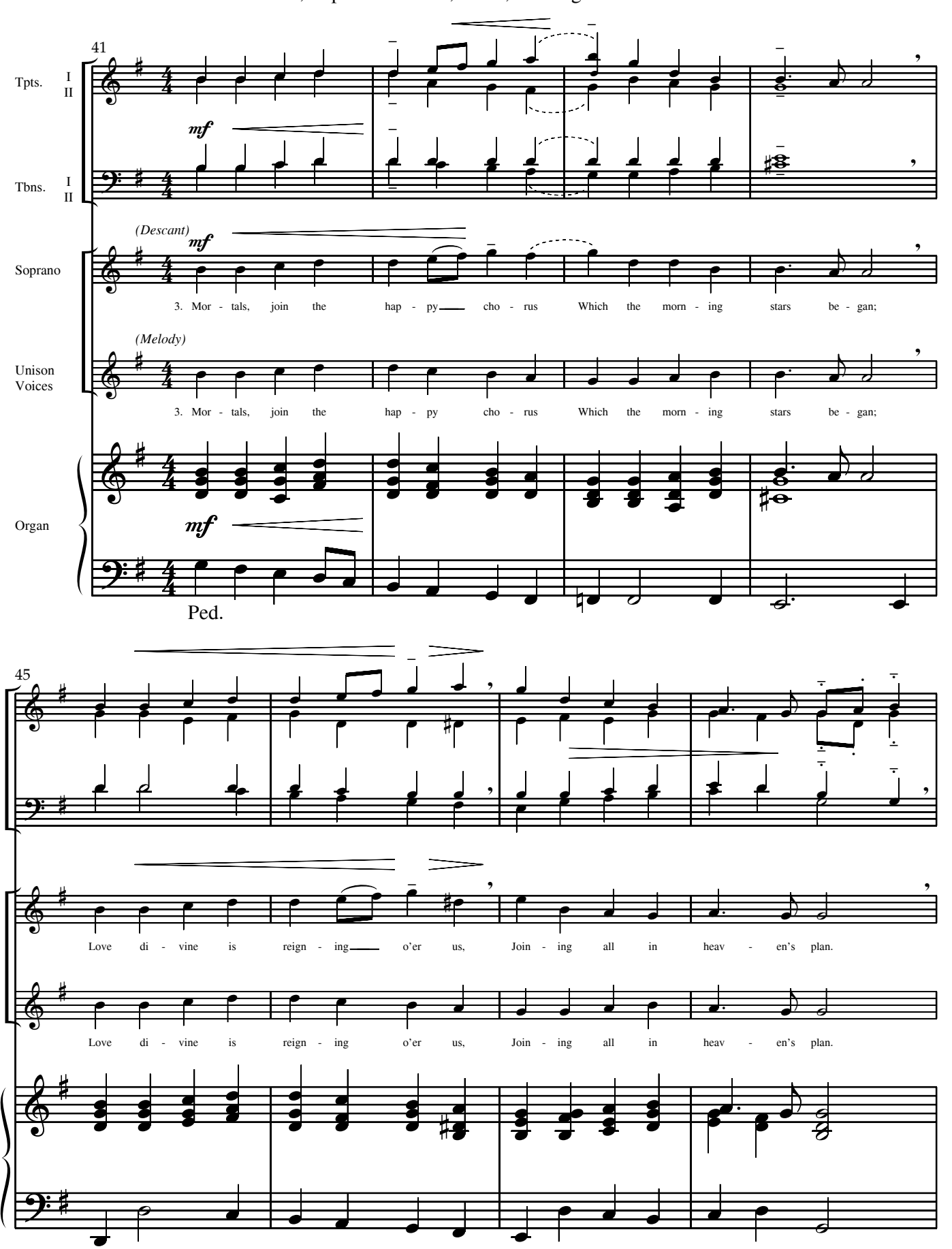
Stanza 3: Unison Voices, Soprano Descant, Brass, and Organ