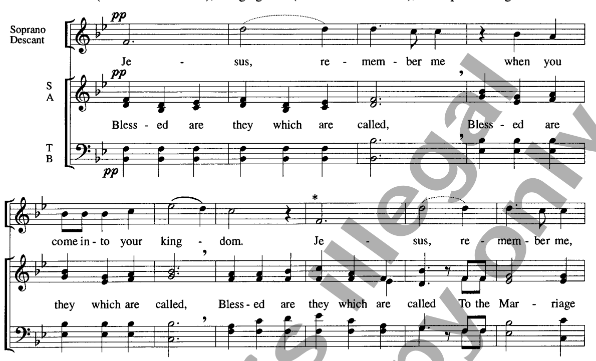
Stanza 5: Choir (SATB divisi), Congregation (Unison), Organ, and Optional Instruments