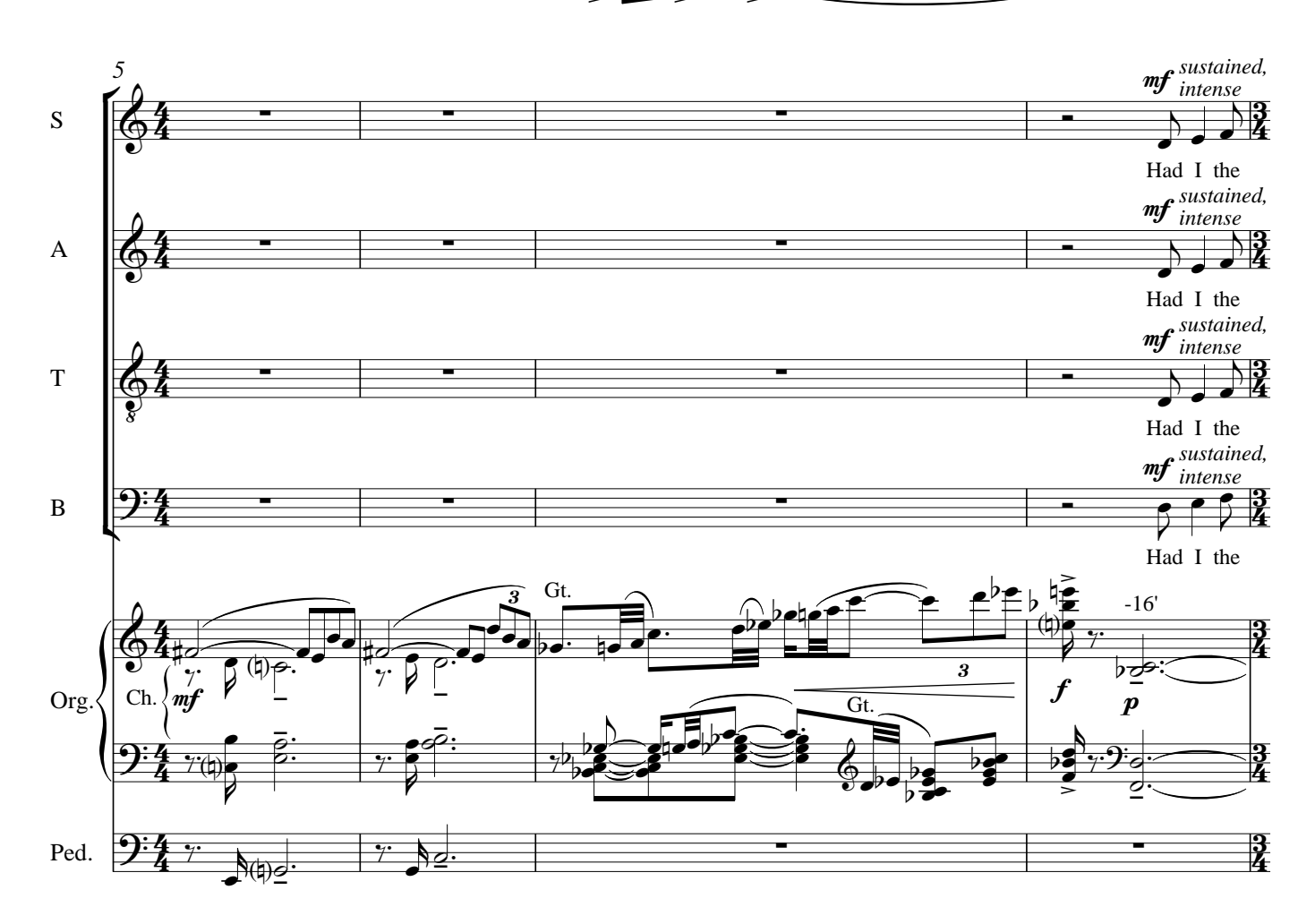
© Copyright 2011 by E. C. Schirmer Music Company, Inc., a division of ECS Publishing, Boston, Massachusetts. www.ecspublishing.com All rights reserved.