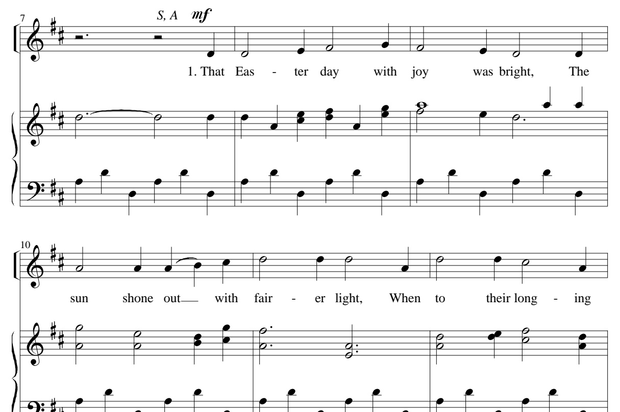
Copyright © 1997 by GIA Publications, Inc., 7404 So. Mason Ave., Chicago, IL 60638 International Copyright Secured All Rights Reserved Printed in U.S.A. Photocopying of this publication without permission of the publisher is a violation of the U.S. Code of Law for which the responsible individual or institution is subject to criminal prosecution. No one is exempt.