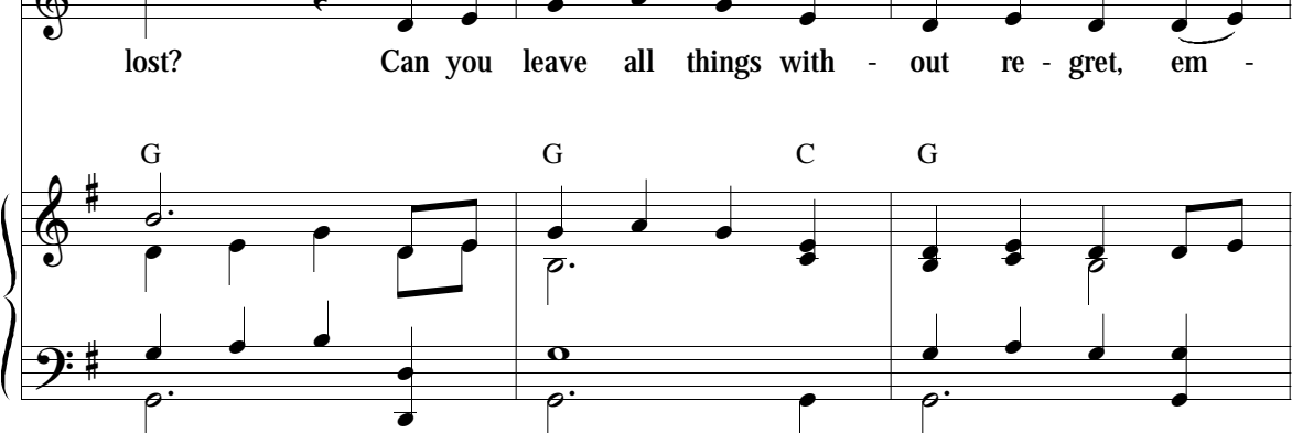
Parts for 2 treble instruments in C and bass instrument in C are available separately from the publisher, G-4594 INST.

Copyright © 1997 by GIA Publications, Inc. 7404 So. Mason Ave., Chicago, IL 60638 International Copyright Secured All Rights Reserved Printed in U.S.A. Photocopying of this publication without permission of the publisher is a violation of the U.S. Code of Law for which the responsible individual or institution is subject to criminal prosecution. No one is exempt.