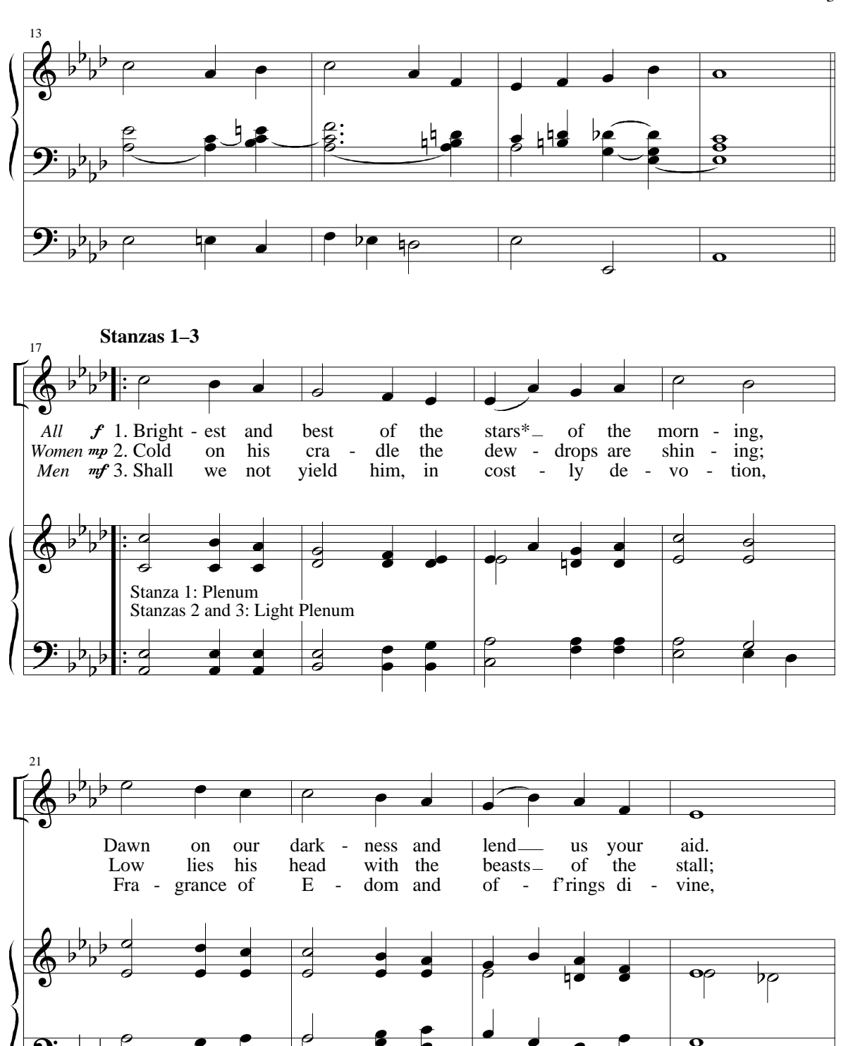
*The word "sons" may be substituted for "stars" in stanzas 1 and 5. The text appears as printed in the Lutheran Book of Worship.